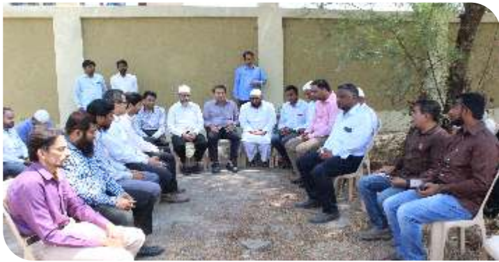
13th May, 2019 : Prayers were offered for the Construction of the New School Building.