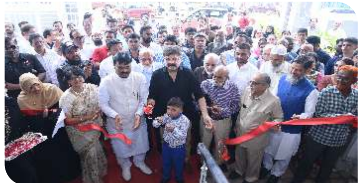
18th June, 2023 : Well-wishers of the organization, inaugurated the New School- Radiant English High School & Jr. College.