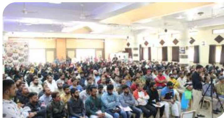
A huge crowd gathered for Admissions (through Lottery) for their kids in Nursery class in Radiant School.