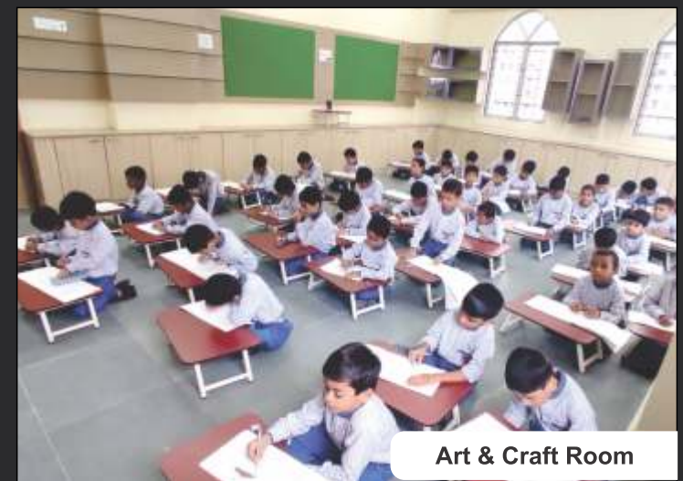
Art & Craft Room