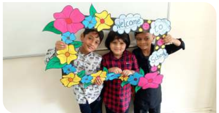
Pre-Primary students of Radiant English School enjoying their First Day in the School.