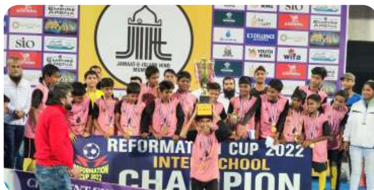
Our Crescent School's Football Team won the first position at the Reformation Cup Football Tournament.