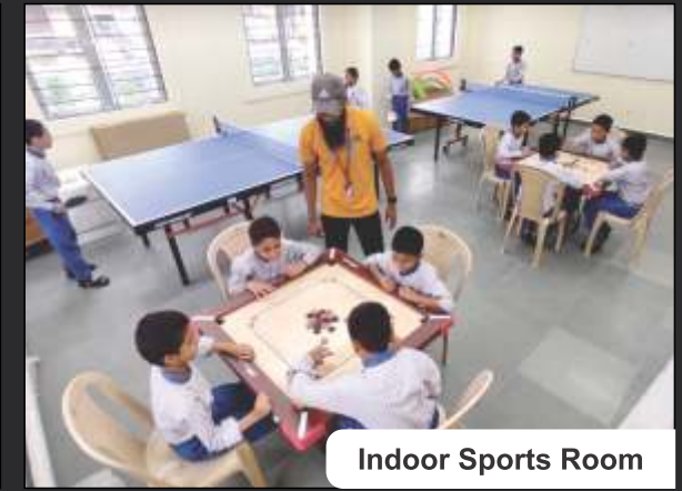
Indoor Sports Room