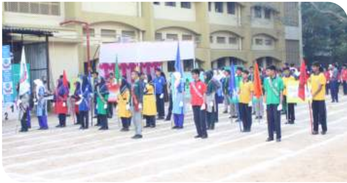
Annual Sports Day at Crescent English High School & Jr. College.