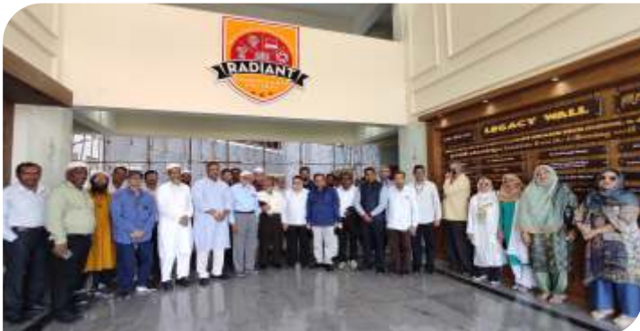
9th February, 2023 : Well-wishers gathered to see the first look of the New School Building.