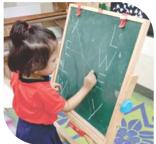
Developing Pincer Grip