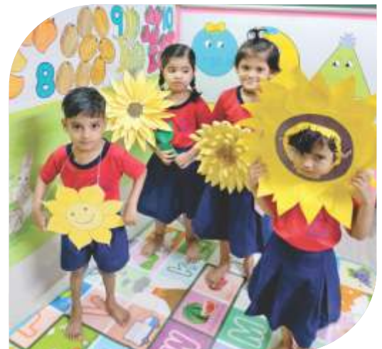
Fun way of Learning