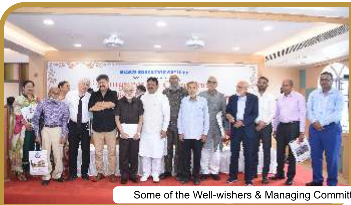
Some of the Well-wishers & Managing Committee members of MES attended the Inauguration Ceremony)