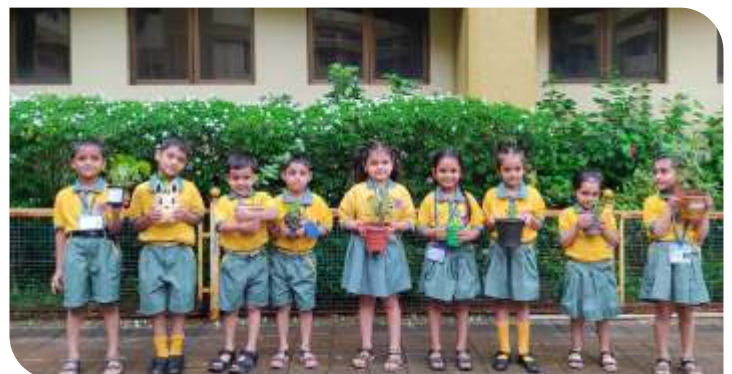
Tree Plantation activity in Radiant School on the occasion of International Tree Plantation Day.