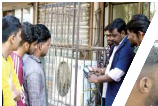
AC & Refrigeration