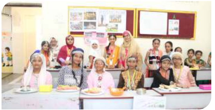
Geography Activity at MES Crescent English High School – Representing different states and its cultures.