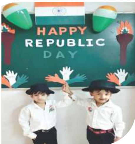
Nurturing Creative Thinkers