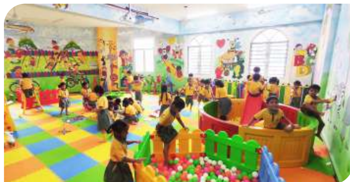
Pre-School kids of Radiant English School having fun in Kids Play Area.