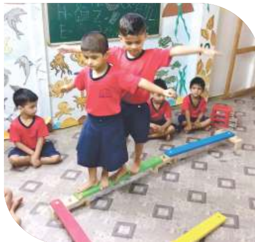
Developing Gross Motor Skills