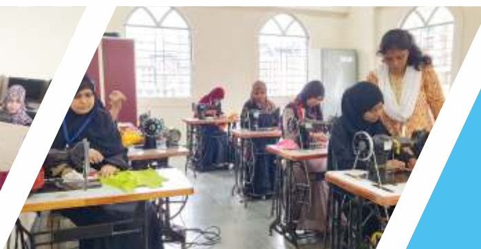
Dress Making & Fashion Designing

VISION : To equip dropout students with skills which will improve their employability.